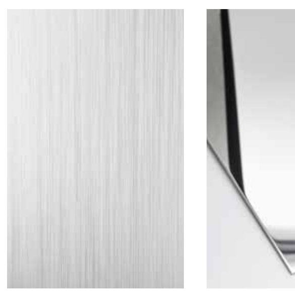
STRAIGHT - DIRECTIONAL BRUSH WITH STRUCTURE